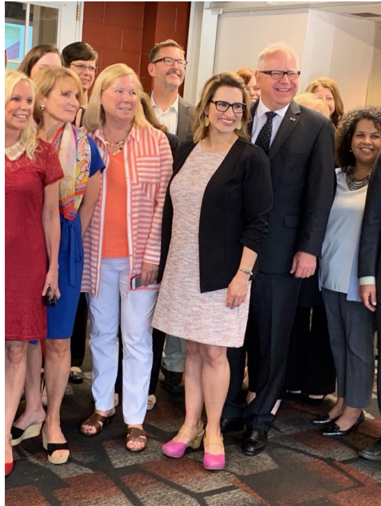
Governor Walz and Lt. Governor Flanagan